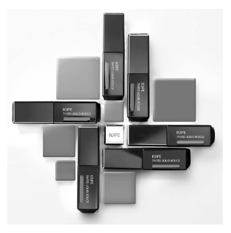
lope lipsticks from AmorePacific

Korean cosmetic products continue to be popular in China, but concern is growing about the online sale of counterfeit products with almost identical brand-logos and appearance. Even fakes of some products not yet officially on sale in China are being offered. Fake versions of AmorePacific's best-selling