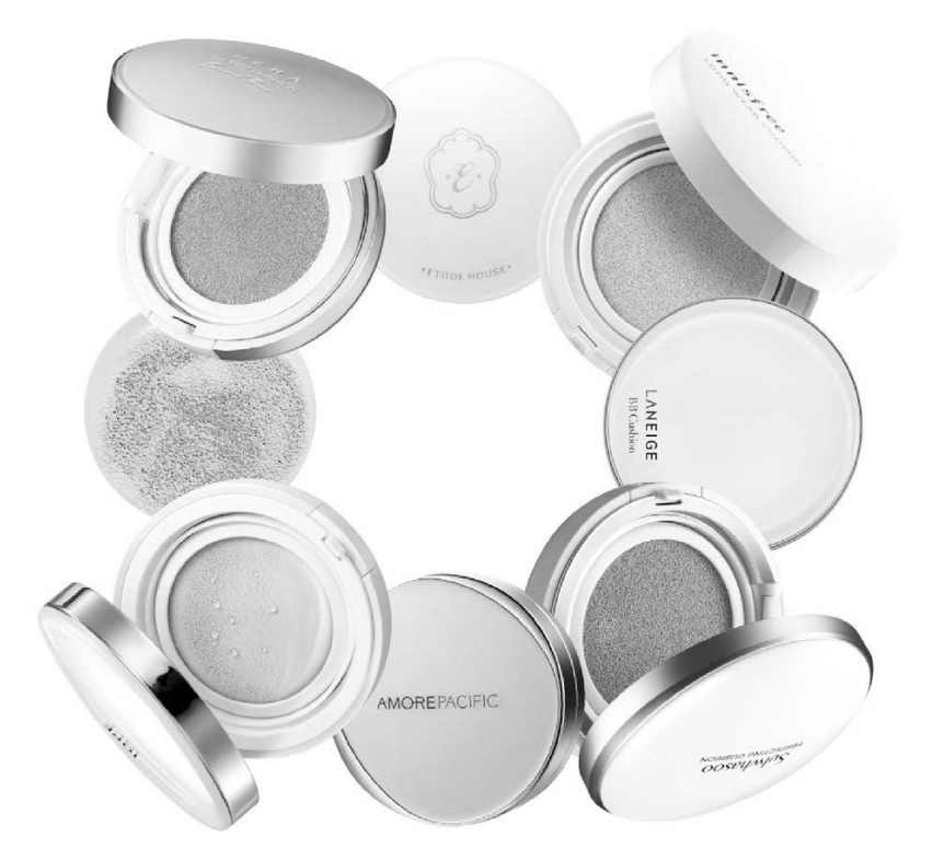
AmorePacific cushion compound