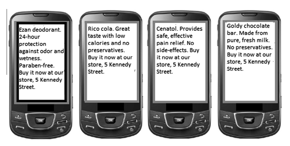
Fig. 1. The SMS advertisements used for the experiment (translated from the original Greek).