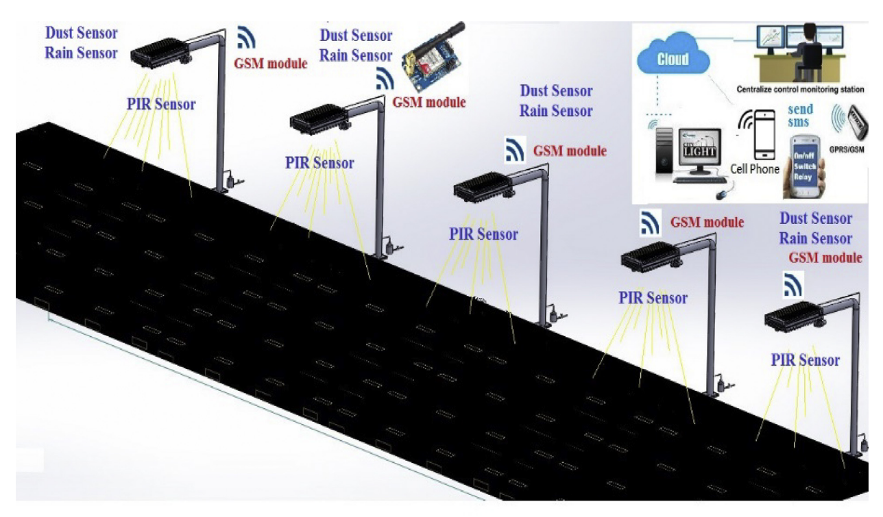
Fig. 4. Schematic of the Internet of Things for lighting control and automatic washing system of lighting lamps surfaces.

detecting pollutants, including the rain and the dust sensors, which were connected to the control board as inputs. Once the surface of the light is detected wet or dusty by the sensors, AWS starts to clean the light.