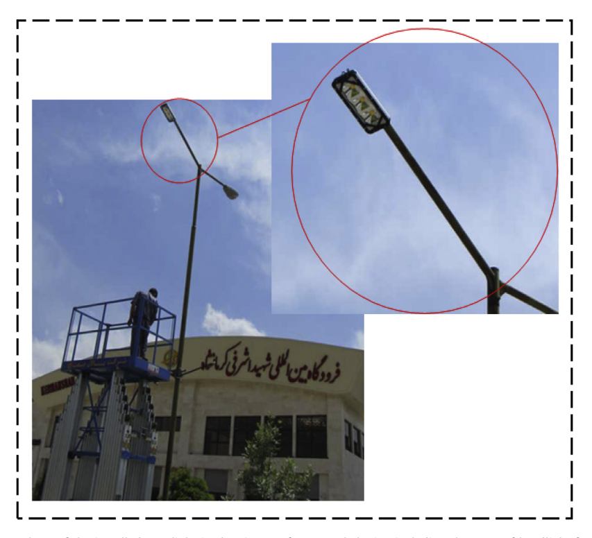
Fig. 1. A photo of the installed LED light in the airport of Kermanshah city, including the zoon of headlight for AWS.