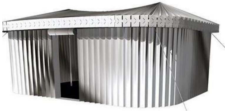
Fig. 1. Textile Wall.

The flexible panel called "Textile Wall" was patented in 2015 by the Politecnico di Milano (Italy), under the European project Speedkits, within the Seventh Framework Programme, and aimed to build housing rapidly in emergency conditions [23]. The patent is very valuable as it is possible to use local materials, not contaminated and easy enough to source, for the completion of mini temporary housing units. The panel is made up of cells composed of thin plates of semi-rigid material which are filled with structural materials, derived from local technologies, and closed by textile membranes. By using this panel, it is possible to create external vertical walls, as well as internal partitions and roofs of various sizes and forms. The traditional construction techniques complement this innovative proposal, which has been presented as an easily displaceable flexible shuttering, thanks to the possibility to pack the folding structure in an easy-assembly kit.