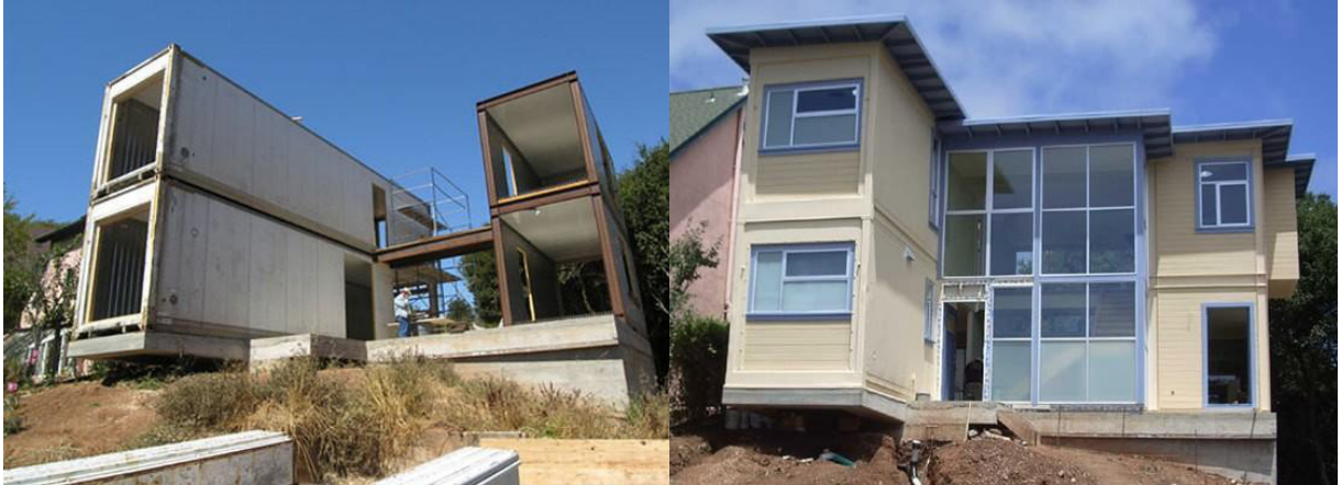
Fig 3. Container home.

The idea of using containers as temporary housing dates back to the 50's, but research in this field has never been abandoned [26]. This solution, easily transportable and mountable in a very short time, even on different levels and configurations, has been developed in particular in the Netherlands. In Europe, container homes are considered not only for emergency shelters but also for a low-cost housing to be implemented in urban areas, for their high ecological and environmental value (social housing, cohousing). The shape is such that it can be an easy support for residual radioactivity shielding. Furthermore, it can be ideally combined with simple completion technologies (foundations, plants), which can be conveniently found on site in the case of post-conflict territories.