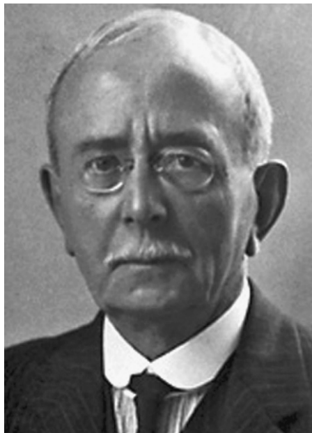
Fig. 1 Sir Charles Sherrington.