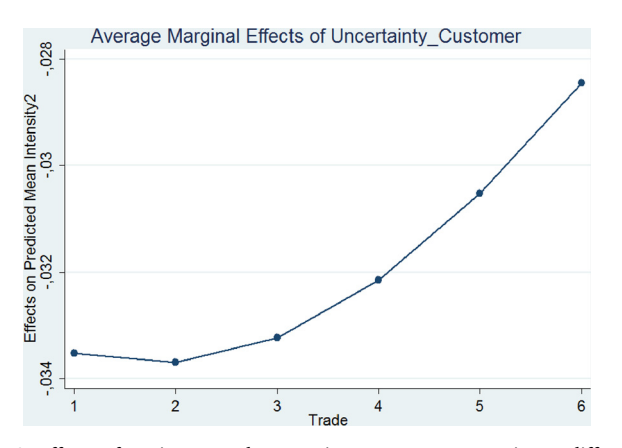
Fig. 2. Effects of environmental uncertainty on Export Intensity at different levels of trade association engagement. Trade Association Engagement: 1 = Extremely Weak Engagement, 6 = Extremely Strong Engagement.

export market moderately decreases the negative effects of environmental uncertainty "customer needs" on international intensity. No statistically significant impact is observed when the dependent variable is the percentage of profits derived from exports. Results partially support H2.