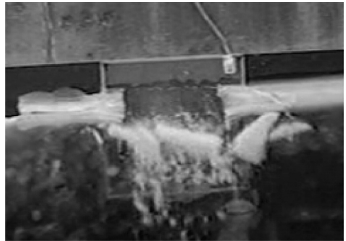
Fig. 8. A nominal 1-m square expulsive system on a Mississippi River lock wall removing collar ice with a single pulse.

Heat for deicing can be provided in many ways, from moist hot air that delivers much of its heat as latent energy, to dry hot air, to new