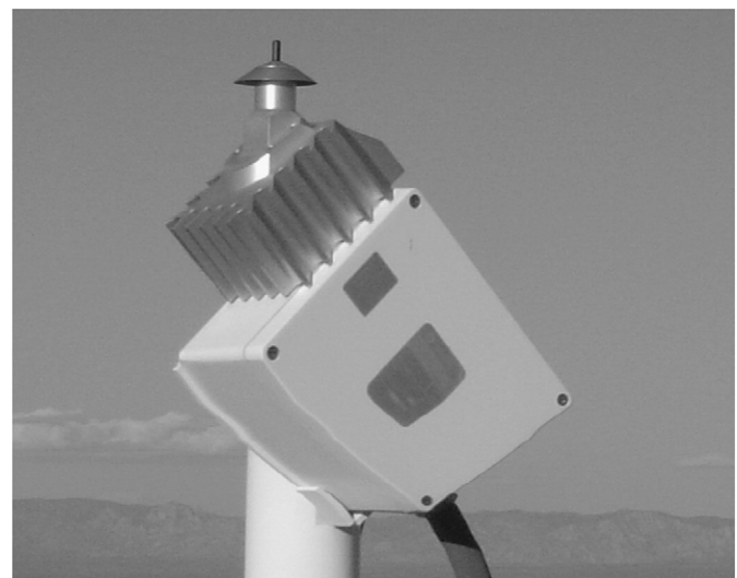
Fig. 13. Probe-style ice detector for measuring freezing rain and freezing drizzle.

Platforms could benefit from a variety of ice detection devices. Imaging and remote detectors, and some conformal detectors, may be