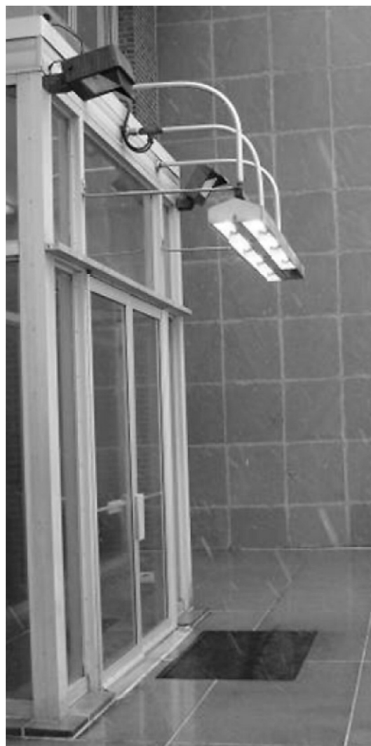
Fig. 10. Infrared anti-icing system protecting front entrance of CRREL.

Manual deicing methods, using wooden baseball bats and mallets, and shovels are the traditional way of deicing marine structures (Fig. 11). Many vessels may have been saved using mechanical deicing