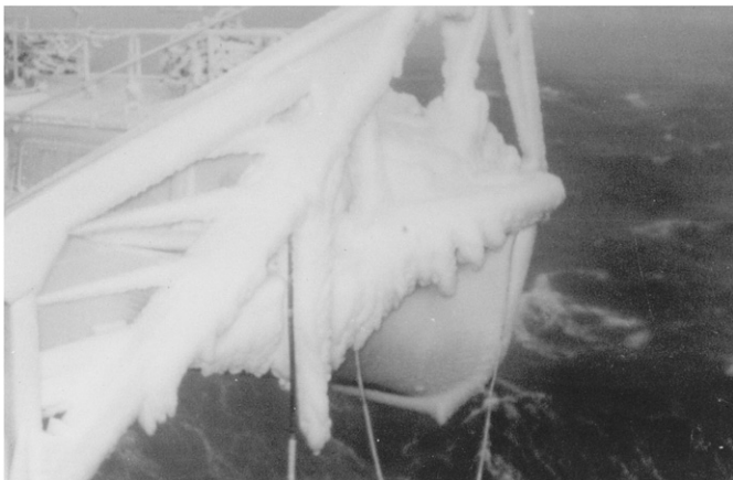
Fig. 4. Ice covering lifeboat, davits, and cables on semisubmersible Ocean Bounty.

Loss of communications would be an unlikely cause of the loss of a platform but could risk crew members' lives if life-threatening events occurred that require rescue or assistance (Fig. 5). Whip and dipole communication antennas readily collect ice because of their small diameters and exposed locations. Water is trapped in the ice, especially if the ice is saline with brine pockets, which raises the dielectric constant and may block signals. Ice also may bridge insulators and short antennas. Loss of radio and radar prevents communication to potential rescuing boats and helicopters. Even though supply boats and helicopters may not be able to reach