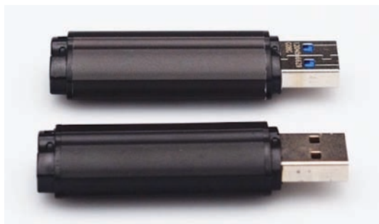
Figure 1. A normal USB drive and a human interaction device (HID)-based attack drive. Traditional OS defenses can be defeated by having a small microcontroller disguised as a USB drive emulate an HID and inject malicious keystrokes.

A more complex attack disguises a different type of USB device as a flash drive. While USB drives can no longer automatically execute code, USB human interface devices (HIDs)—such as keyboards and