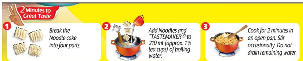
Exhibit 8 Preparation Directions on Maggi Noodle Packages in India