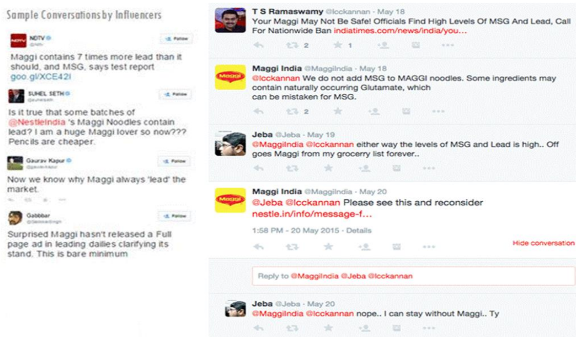
Exhibit 6 Examples of Social Media Conversations about Maggi