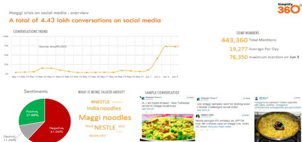
Exhibit 5 Social Media Coverage of the Maggi Crisis