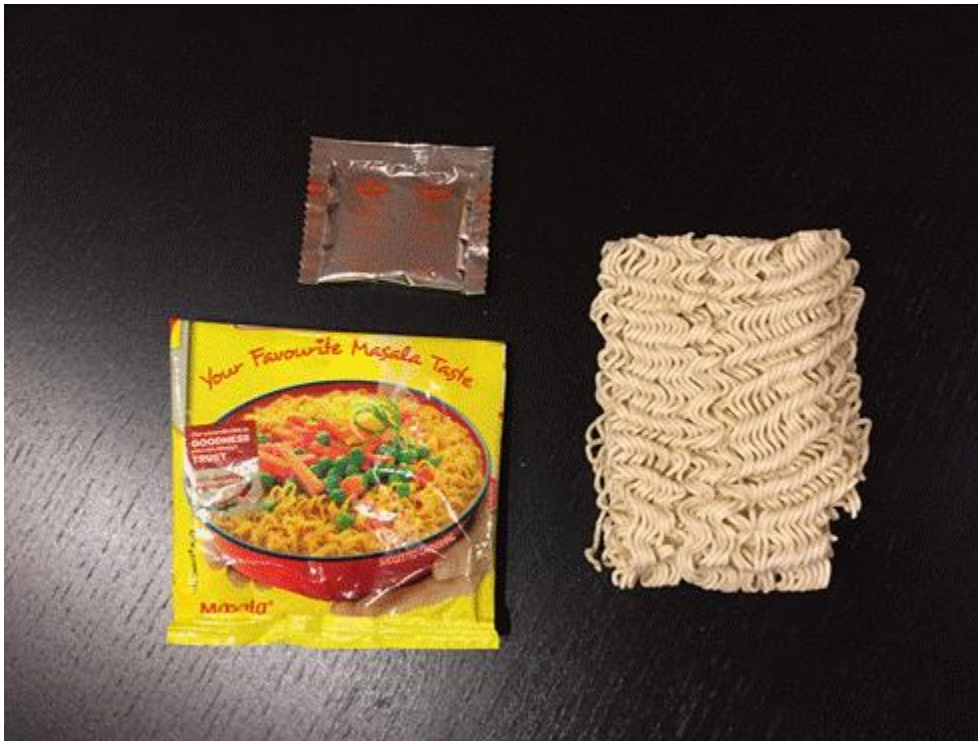
Exhibit 9 Contents of Maggi Noodles Packages in India: Noodles and Tastemaker Packets