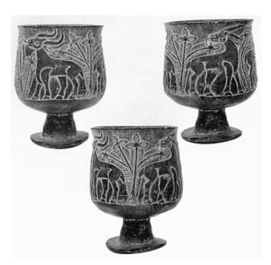
Fig. 10. Catalogue, pp. 21–23.