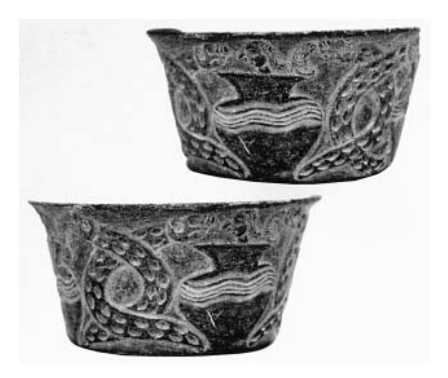
Fig. 4. Catalogue, pp. 54–56.