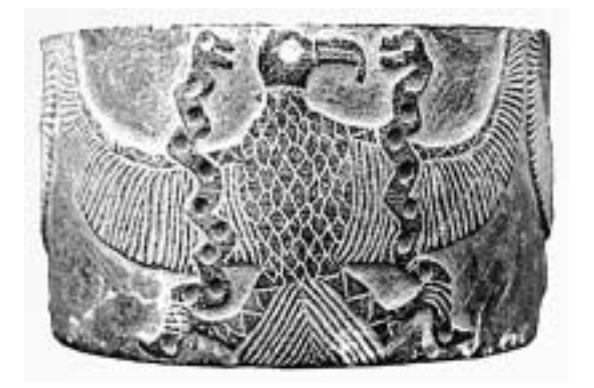
Fig. 17. Catalogue, pp. 95–96.