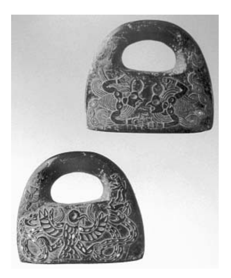
Fig. 7. Catalogue, p. 126.