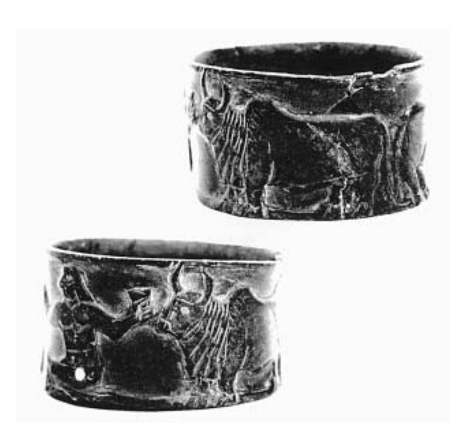
Fig. 3. Catalogue, pp. 47–48.