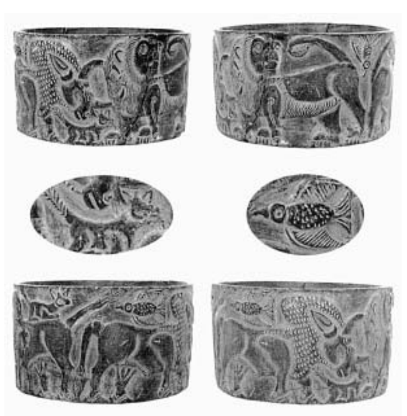
Fig. 14. Catalogue, pp. 58–59.