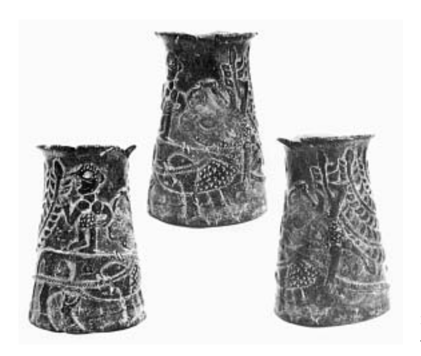
Fig. 15. Catalogue, pp. 65-66.