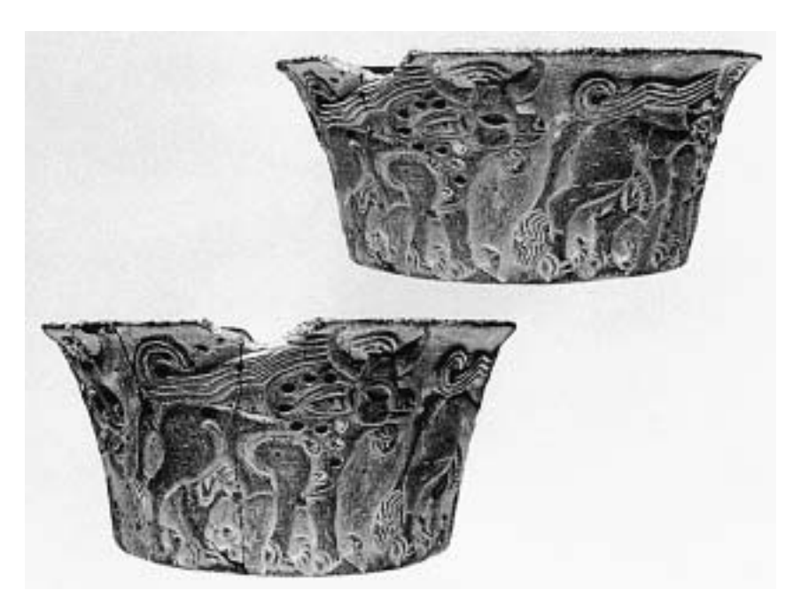
Fig. 2. Catalogue, pp. 45–46.