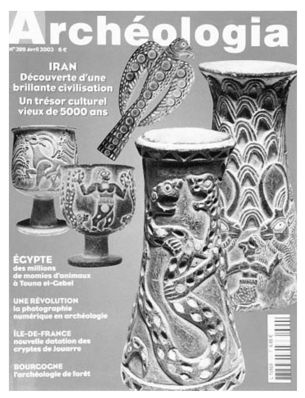
Fig. 1. Archéologia, April 2003, cover.

inadequate, descriptions of some of the published objects; and less than a page dedicated to mentioning—but not evaluating—how the objects came into existence in the first place (other than to note that confiscation occurred). Utterly missing is awareness of the total absence of an archaeological background associated with the confiscated corpus and a perception of its limited value as data for archaeological and cultural