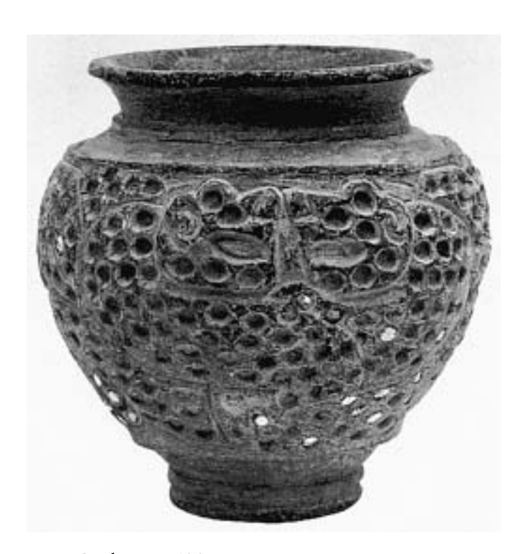
Fig. 5. Catalogue, p. 106.