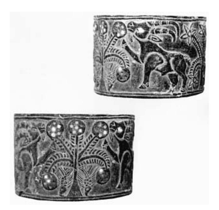
Fig. 13. Catalogue, pp. 34-35.