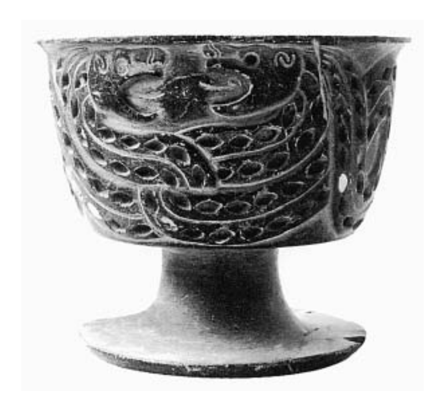
Fig. 18. Catalogue, p. 105.