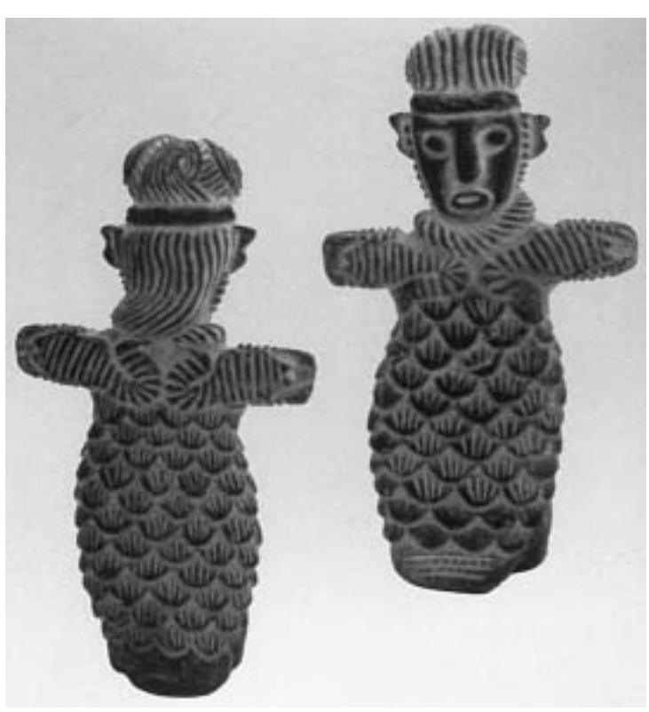
Fig. 8. Catalogue, p. 139.