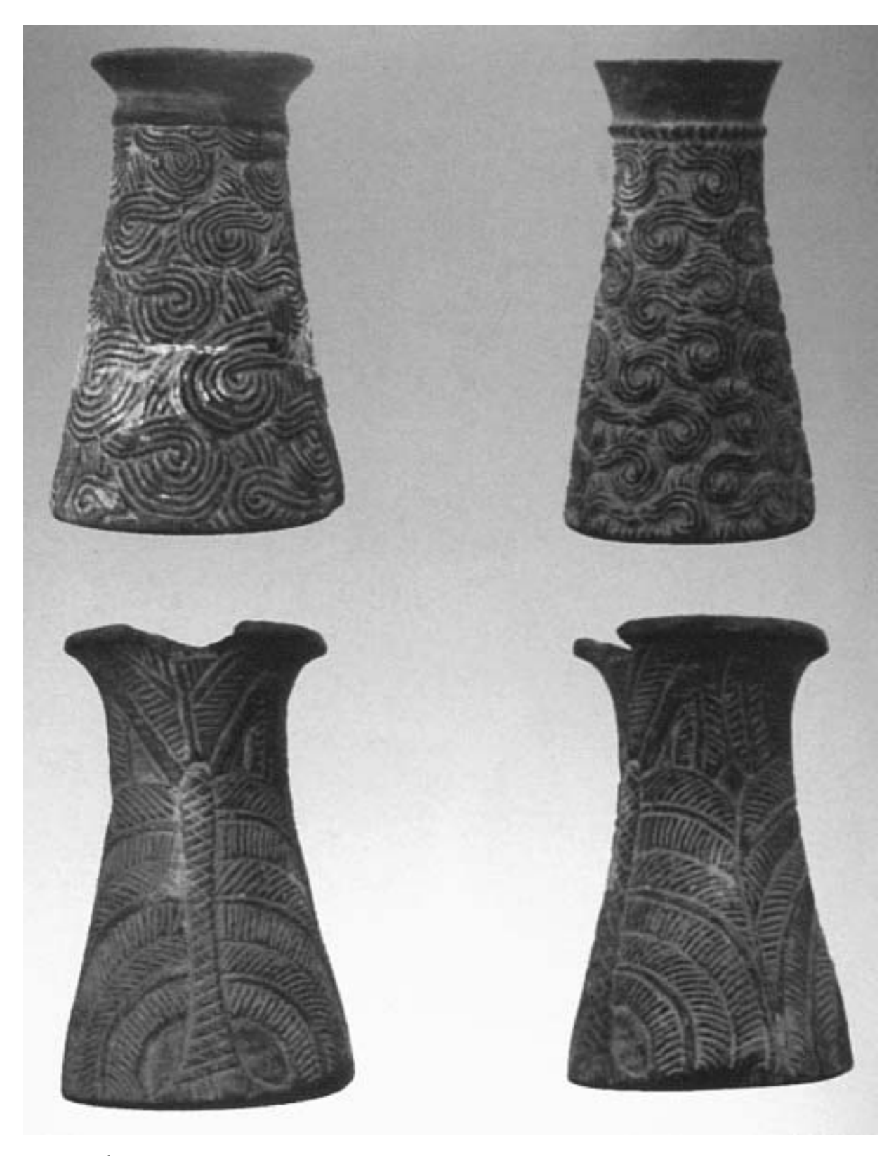
Fig. 6. Catalogue, p. 118.