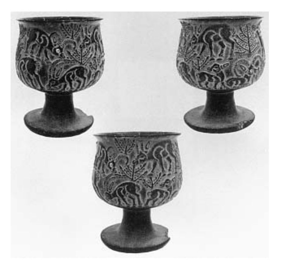
Fig. 12. Catalogue, pp. 18–20.