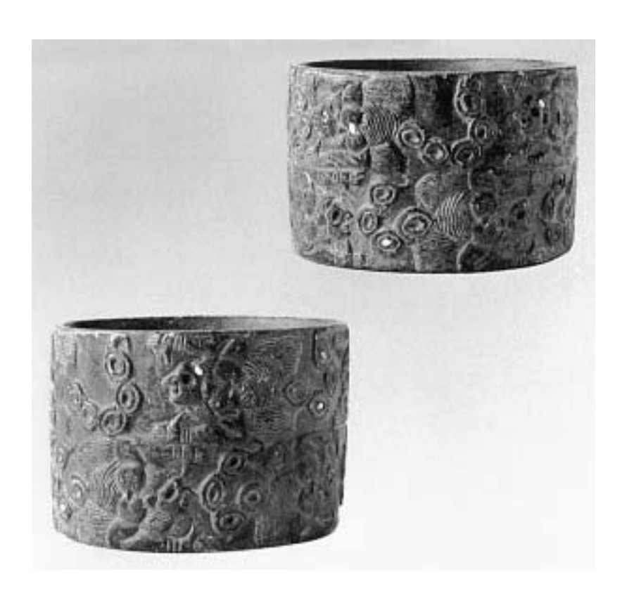
Fig. 19. Catalogue, pp. 112-13.