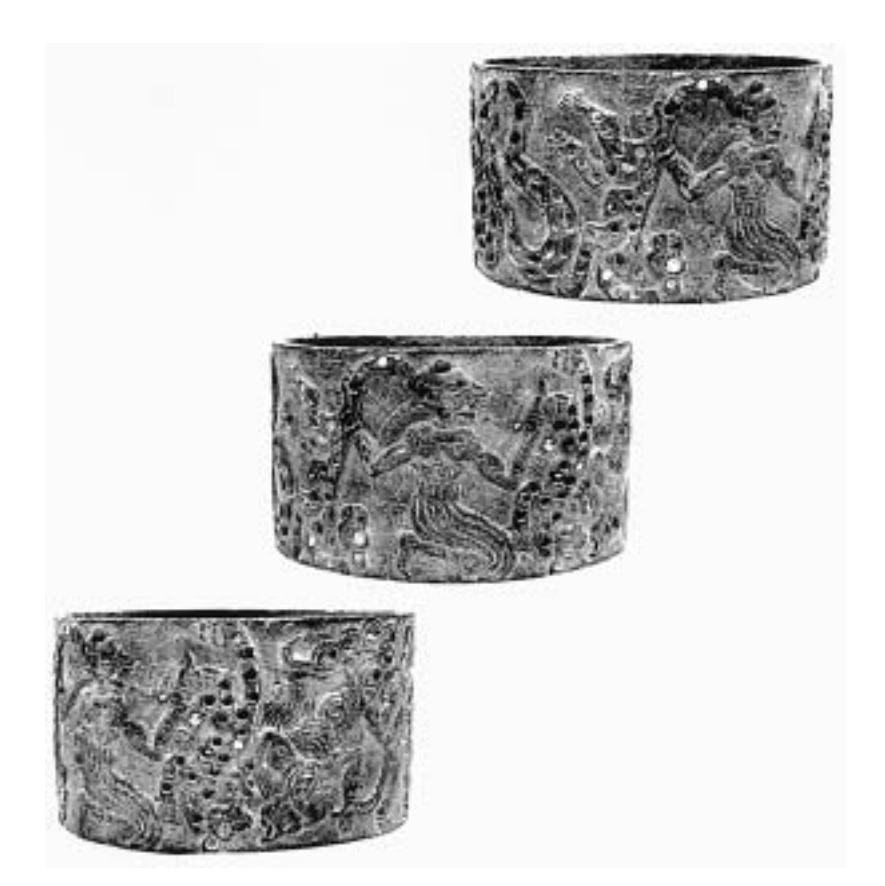
Fig. 9. Catalogue, pp. 15–17.