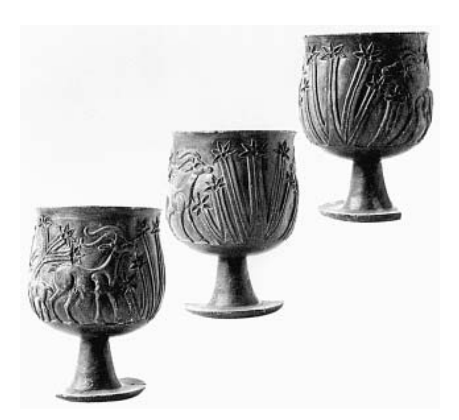
Fig. 11. Catalogue, pp. 30–31.