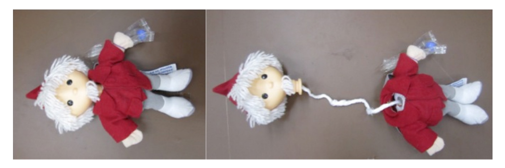
Fig. 1. Photographs of the doll intact (left) and broken (right).