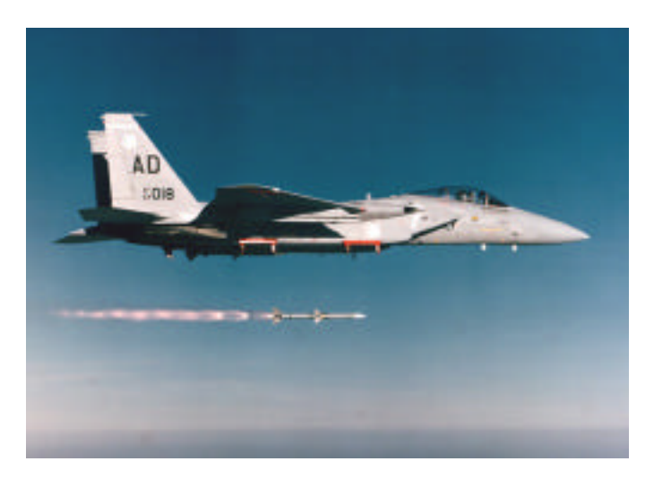
Figure 1: An AMRAAM in flight after launch

AMRAAM is in full rate production at the Raytheon Company in Tucson, Arizona. Formerly, the AMRAAM was produced at both the heritage Raytheon Company in Andover, Massachusetts and the heritage Hughes Aircraft Company Tucson facility. AMRAAM production operations were consolidated at the Tucson facility after Hughes sold its defenseelectronics business to Raytheon.