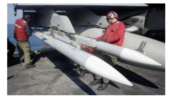
Figure 2: Navy personnel on a carrier working on an AMRAAM system

Among the benefits listed by Raytheon, AMRAAM has the "highest dependability at lowest cost of ownership." Production AMRAAMs currently exhibit mean-time-between-failure of more than 1500 hours. The AMRAAM performance and reliability have been proven in combat, with combat victories over the skies of Iraq, Bosnia, and Kosovo.