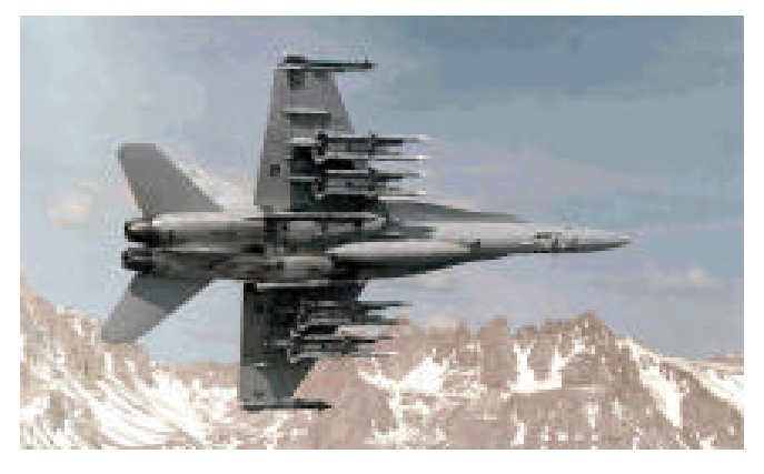
Figure 3: An AMRAAM Arsenal (FAS Military Analysis Network photo) (www.fas.org/man/dod-101/sys/missile/aim-120.htm)