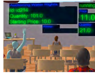
Figure 4: Bot bidding in a running auction

artificial skin colours that represent their roles (see Figures 3 and 4). Fig. 3 shows the login to the institution: the human participant sends a private message to the Institution Manager bot with the password and role (either seller or buyer). Fig. 4 illustrates how human participation in the auction has been improved by providing a comprehensive 3D environment. There, the market facilitator bot appears sited at a desktop and buyer participants at the chairs in front of it. This room includes dynamic information panels. Moreover, bots’ bid actions can be also easily identified by human participants since they are displayed as raising hands.