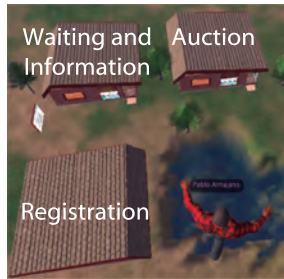
Figure 2: Initial aerial view of v-mWater

market facilitator conducts the auction and the basin authority announces the resulting valid agreements.