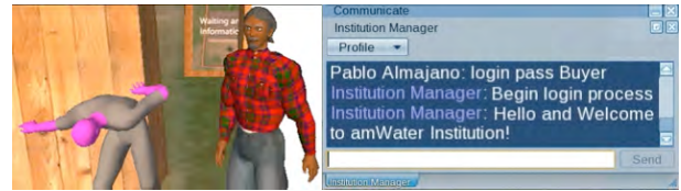
Figure 3: Human avatar login: interaction with a software agent by means of a chat window