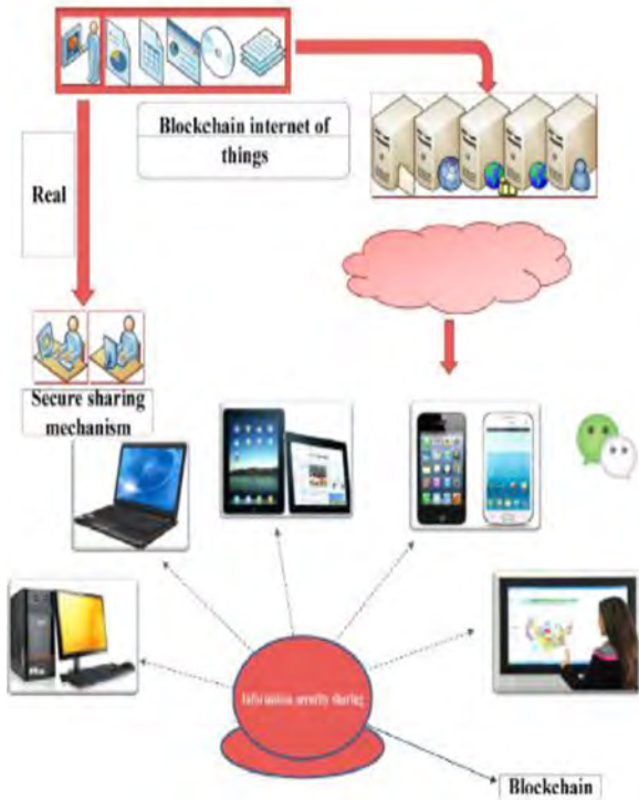
Fig. 3.2. Security Framework for information Sharing in IoT.