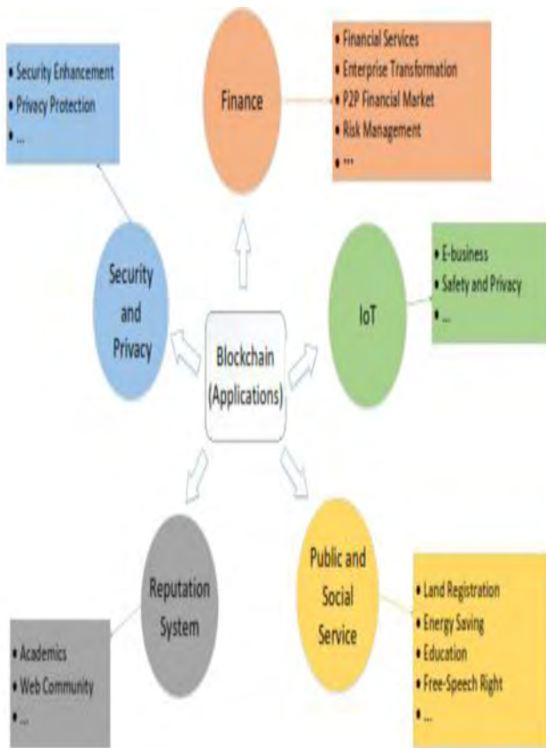
Fig. 4.1. Representative application domains of Blockchain.