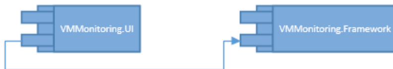
Fig. 2. Component diagram

VM-Monitoring.UI is consist of views that are shown to user it also includes graph showing data points of instance which is configured by cloud service consumer in this web application. For that user need to provide their Account keys (Access key and secrete key if account is associated with AWS, Subscription Id and certificate thumbprint if users account is associated with Microsoft Azure).