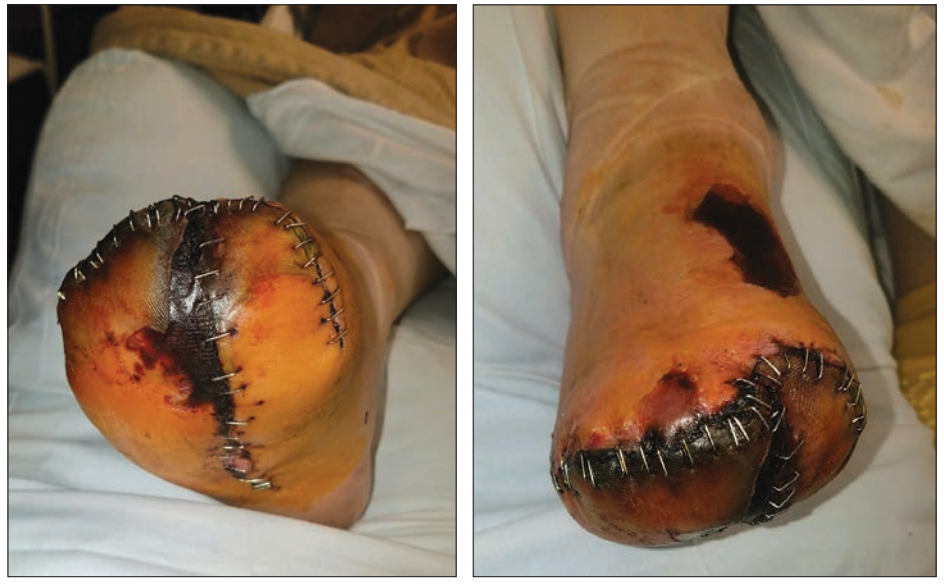
Figures 2 and 3: Clinical presentation of patient post-operatively. Black ischemic tissue can be seen along the plantar flap and incision.

If retrograde flow is established to the plantar flap, presumably due to occlusion of the posterior tibial artery, then the connection between the dorsalis pedis and lateral plantar artery also needs to be taken into consideration at the time of the incision in order to preserve this retrograde flow.<sup>7</sup> If an anastomosis is disrupted by surgical trauma in a