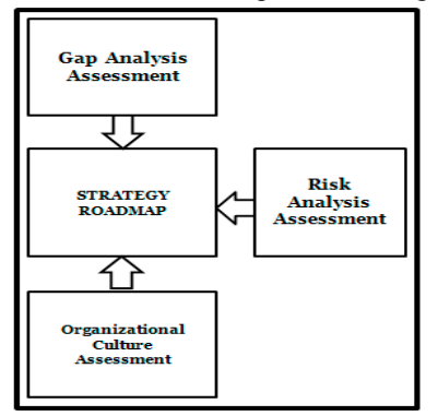
Fig. 2. KM Strategy Roadmap of GHCM Analysis Method

The analysis of KM strategy roadmap of GHCM methods represents in Fig. 2