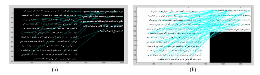
Fig. 4. (a) Same font: one bold and the other one normal. (b) High key point matching rate on different texts with the same font and font size