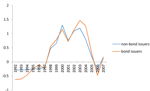
Fig. 3. Average interest rate sensitivity of European firms by year and bond market status.

floating rate lending, which makes them a likely source of corporate interest rate exposure.