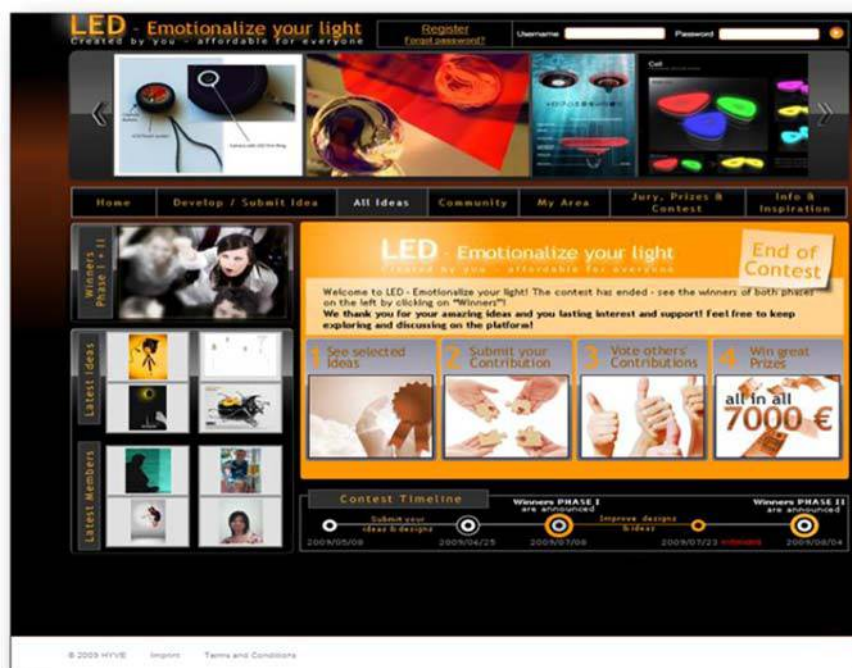
Figure 2. The LED emotionalize your light design contest

our online questionnaire was sent out to all 952 participants that had initially registered for the contest. For the main questionnaire, we received data from 132 participants. Cases with excessive missing (more than 10% according to literature) were removed. We also deleted cases with a completion time of less than 3 minutes. Once the data purification process was completed, 121 cases remained for further analysis, a (purified) response rate of 13 percent. The data for loyalty t_1 was then matched with the data from the main questionnaire based on the logfile user identifier. To test for a possible non-response bias, we compared the means of early responders and late responders (Armstrong and Overton, 1977), finding no significant differences. Thus, non-response bias did not seem to be a problem. We also compared the survey sample to the total contest population of 952 participants about whom we had received the personal demographic data supplied upon registration. As Table I shows, there is no significant difference between our sample and the total population in terms of gender, but survey participants were on average somewhat older than the average contest participant (mean age 29 years vs 27 in the basic population).