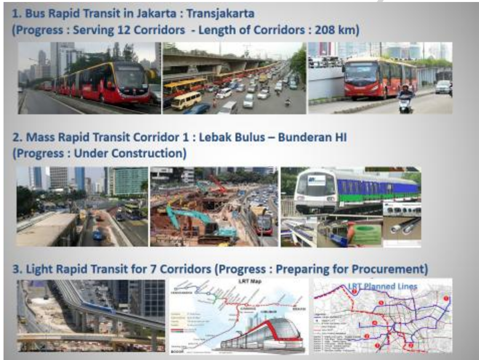
Figure 5. Some Public Transportation Projects in Big Cities in Indonesia

financed by national or sub-national budget resources and cooperation with private-sector entities. Among others are bus rapid transit (BRT), mass rapid transit (MRT), and light rapid transit (LRT).