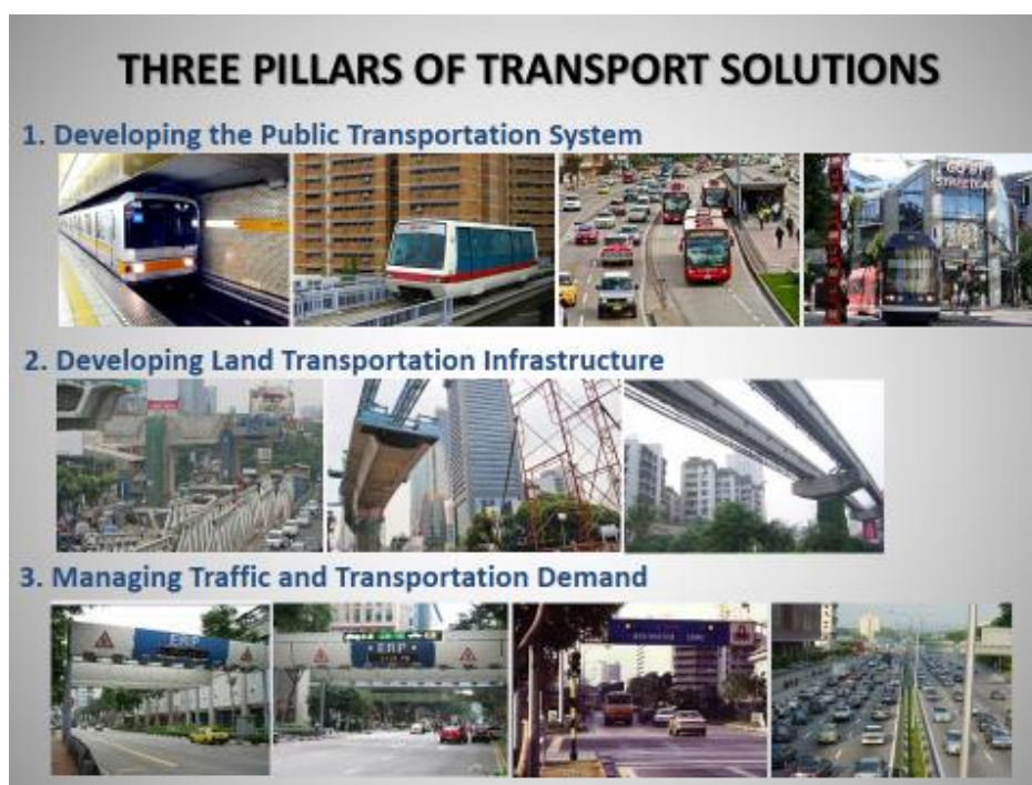
Figure 4. The “three pillars” of transportation solutions

The general tendency to make trips by public transportation is an inevitable one. Any means of public transportation, for intra- or inter-urban trips alike, needs to at the highest-possible level of development in order to reduce traffic accidents, create more effective and efficient transportation means for people, and comply with environmental issues. It is also important to underline that efforts to develop road infrastructure always encounter issues like land acquisition and social problems. Land is difficult to acquire for any infrastructure as land belongs to individuals and not to the government. Limited transportation infrastructure budgets at the national and sub-national levels are also reasons behind the slow growth of road infrastructure. Involving the private sector in transportation infrastructure is a challenge due to the high-risk nature of infrastructure and the minimal economic yield; thus, transportation infrastructure is often left to the government’s responsibility as part of the public domain. On the other hand, some strategic financing from the private sector may be sought for public transportation through public-private partnerships such as turnkey arrangements, concessions, BOT, BTO, and availability payments.