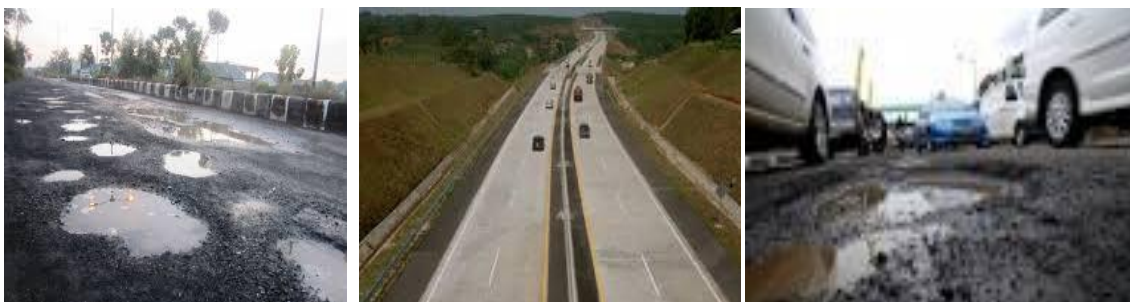
Figure 2. The situation and conditions of road infrastructure

Furthermore, Figure 2 illustrates the existing situation and conditions of poor road infrastructure in some areas of the country. Given the poor conditions and maintenance of the pavement, the current state of the roads is one cause of traffic accidents, especially those involving motorbikes.