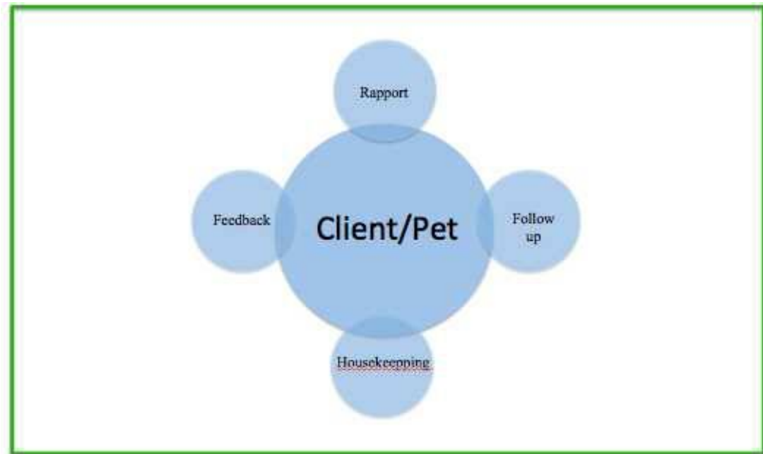
Figure 1- Integrated techniques applied to Organizational Management

Some successful techniques in other sectors can and should be used in veterinary medicine to improve the organization's image, brand and quality in services. Next, we present some of these techniques, which, when implemented in an integrated way, add value to the service and to the way employees and customers recognize this service. Worth noting that these techniques shall be implemented in an integrated and simultaneous way, since they should be present during the entire process (Figure 1).