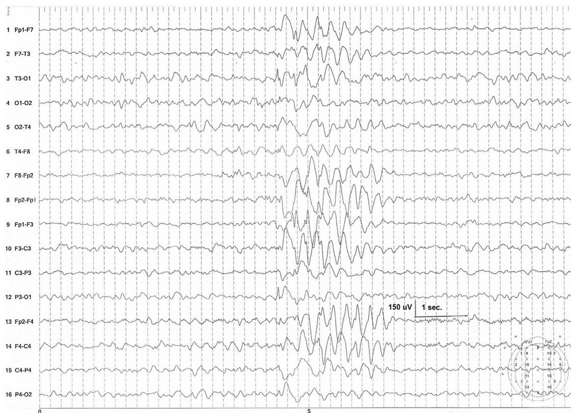
Fig. 2. The interictal EEG recording when awake shows centro-temporal sharp waves preceding irregular generalized spike-and-wave paroxysms predominantly in the anterior regions in an 8-year-old boy.

Idiopathic childhood focal and generalized epilepsies are classically defined by their specific focal EEG findings and clinical correlates. They are assumed to have a commonly shared genetic background because of their idiopathic etiology. This may be explained by the concurrence of rolandic epilepsy and Panayiotopoulos syndrome and absence features [9,10] in the same patients, as seen in the benign childhood susceptibility syndrome [11].