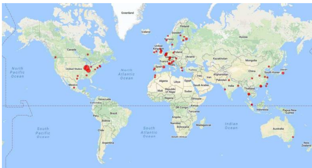
271x144mm (96 x 96 DPI)