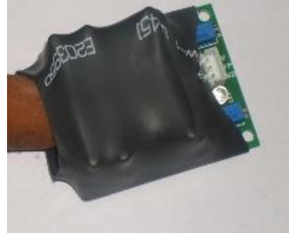
Figure 3. Heart Beat Sensor

applicable to a reduced body part, such as the finger or the ear lobe. However, in the reflectance PPG, the light source and the bright detector are both placed on the same side of a body part. The light is emitted into the tissue and the reflected light is measured by the detector. As the light doesn't have to penetrate the body, the reflectance PPG can be activated to any parts of human body. In either case, the detected light repeated from or transmitted through the body part will fluctuate according to the pulsatile blood flow caused by the beating of the heart.