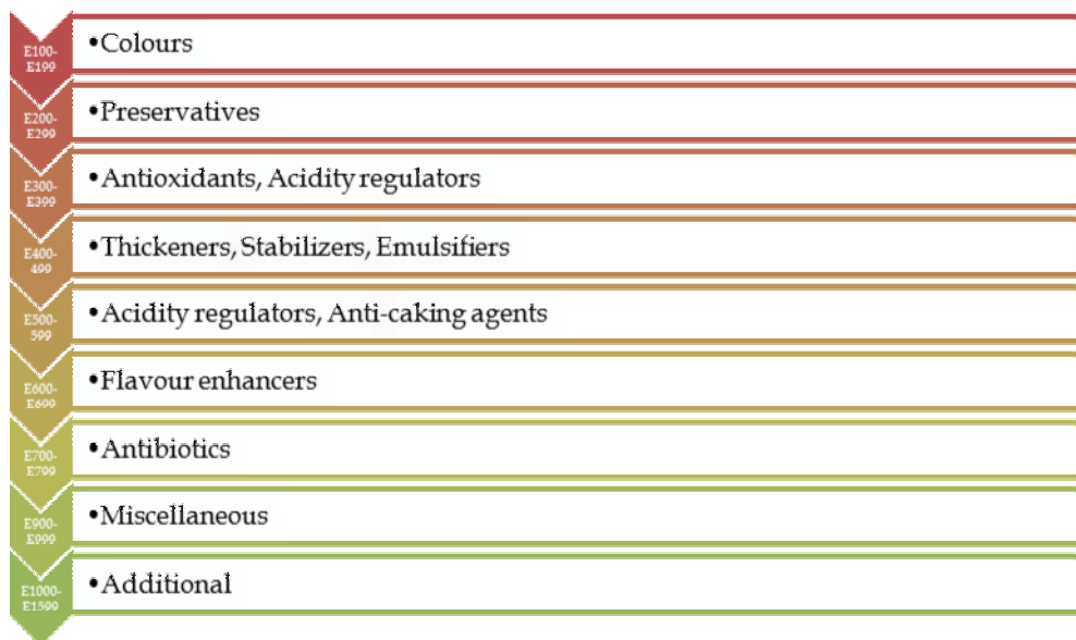
Fig. 2. Classification of additives by numeric range

In the EU, to authorize a substance as a food additive, a reasonable case of technological need, no hazard to consumers at level of proposed use and no misguidance to consumers should be demonstrated. To evaluate whether the newly released food additive has an effect on health; The European Commission is required a consultancy from Scientific Committee on Food (SCF). In this context, SCF deals with questions relating to the toxicology and hygiene in the entire food production chain for consumer health and food safety issues. For submission of a new food additive, the evaluation process by the SCF requires administrative, technical, toxicological data and references (European Commission Health & Consumer Protection Directorate, 2011). Among these, toxicological data obtained from experimental studies have a crucial role for consumers' health due to the presence of any additive in food.