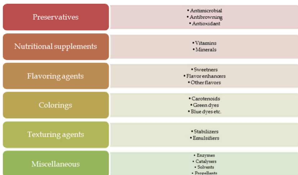
Fig. 1. Six main categories of food additives

Advances in food technology have resulted in an increased number of modified foods and additives in 20th century. An additive is a substance which may intentionally become a component of food or affect its characteristics. There are about 3000 different food additives defined up to date. Food additives may be divided in several groups; although there is some overlap between them. Main six categories of food additives are classified as preservatives, nutritional supplements, flavoring agents, colorings, texturing agents and miscellaneous. According to the functional classes, definitions and technological functions, food additives are summarized in Figure 1 (COABISCO, 2011).