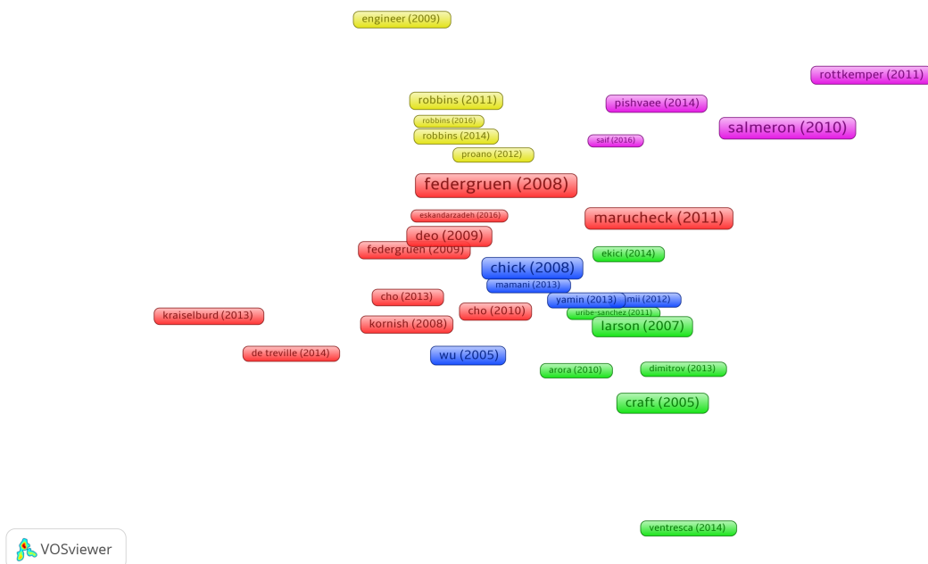
Figure 2: Mapping of the publications in this review, with node and font size representing the weight of a publication. The different colors represent the clusters.

tool is used to structure and visualize the papers based on co-citations. VOSViewer constructs a map in which the publications are represented by labeled nodes. The map contains only the most important publications, for others the labels are omitted to avoid overlapping labels. The distances between the nodes are based on bibliographic coupling, i.e., the number of references that publications share. Hence, the closer two publications are in the map, the more shared references they have. The weight of a publication is measured as the total bibliographic coupling with all other publications. Node size and font size of the labels are used to express this weight. Besides the construction of the map, VOSviewer also supports clustering of the publications using a clustering algorithm. This algorithm assigns weights to each combination of publications dependent on the bibliographic coupling. The optimal clustering is determined by minimizing a weighted distance function, where the distance between publications depends on whether they are in the same cluster or not. In the map, colors are used to distinguish between the publications in the different clusters.