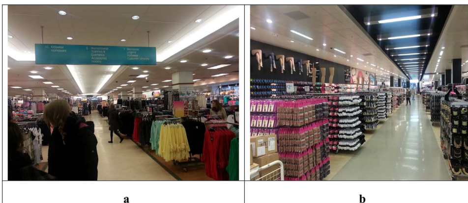
Fig. 2. Images of the two designs: a) the older store layout, signage, fixturing, lighting and color; and b) the newer store layout, signage, fixturing lighting and color.

The sampling of high numbers of females is justified on the basis of their representativeness of an important market for fashion consumption. Both stores are within 200 m walking distance of one another with very similar consumer groups serviced in both stores. Other research to deliberately survey high proportions of females in retail contexts includes Yoo et al. (1998), Michon et al. (2007). Apparel and accessories stores frequently target female shoppers, and males tend to generate model noise given their different attitudes to fashion, according to Michon et al. (2007), and may contribute to structural and factor loading invariance. These approaches to sampling and survey administration address the demands of Sudman (1980) for careful sampling to also observe eligibility and ties constraints as consumers pass specified