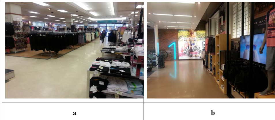
Fig. 3. Images of the two designs: a) the older store layout, signage, fixturing, lighting and color; and b) multi-media screens and materials used in the newer design.

locations before they are intercepted to participate in surveys. Minimal confounding effects, such as sales promotions, took place during the survey administration. Consumers were intercepted after they visited the checkout and had thus spent time in the store.