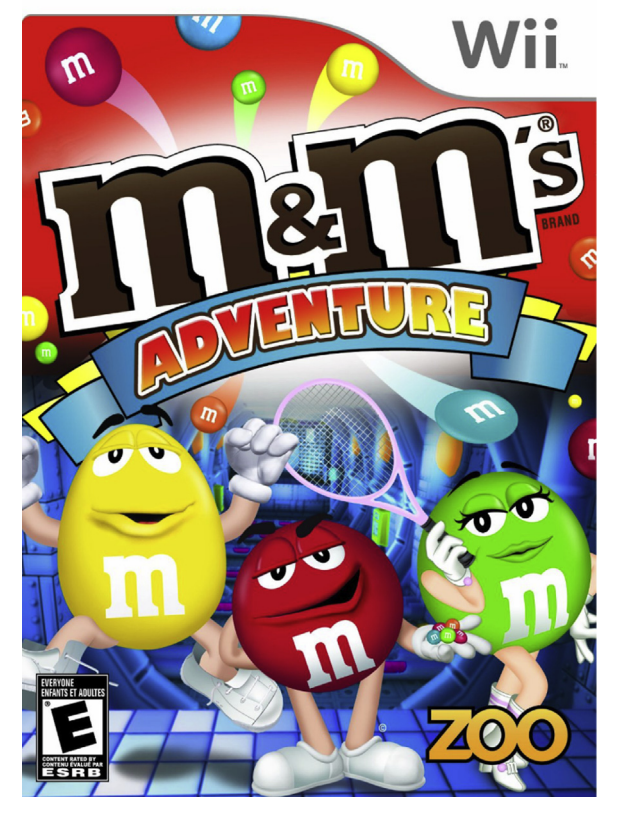
Figure 4. M&M's Adventure for Wii.

placements. Table 3 provides examples of sports video games with food industry references. The presence of food brands in video games has been shown to promote consumption of