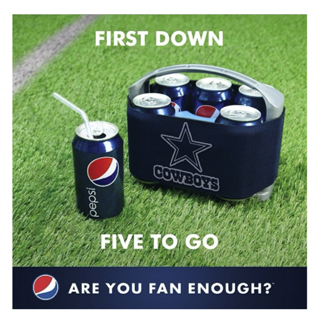
Figure 2. Pepsi Instagram post.

activity. One study showed that most products promoted by professional athletes are energy dense and nutrient poor [57]. Table 2 shows some examples of food products endorsed by athletes.