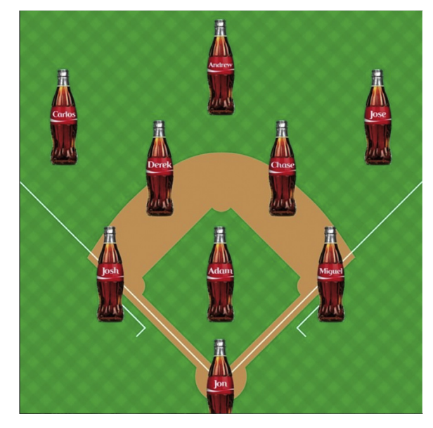
Figure 1. Coca-Cola Instagram post.

Athlete endorsements are another common tool used by the food industry to promote products. Babe Ruth endorsed several products during his career, including Red Rock Cola and Wheaties Cereal. Whether food companies deliberately associate their brands and products with sports as a way to associate with health and fitness is unclear, but regardless of intent these partnerships are concerning given emerging evidence that sports advertisements make nutritionally poor products seem healthier [56]. Endorsement of unhealthy products by athletes further conveys a false message about good health by suggesting that intake of nutrient-poor products is congruent with physical