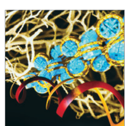
Molecular Biology International

International Journal of Evolutionary Biology