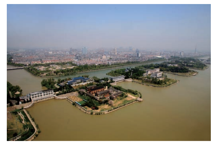
Fig. 2. Jiangdu Pumping Station in the East Route Project (ERP).

Beijing has seen an improvement in its water self-purification capacity by the coordinated use of SNWDP water and locally reclaimed water. Up to 2.5 \times 10^8 m<sup>3</sup> of SNWDP water has been tentatively recharged for groundwater in Beijing; groundwater ex-