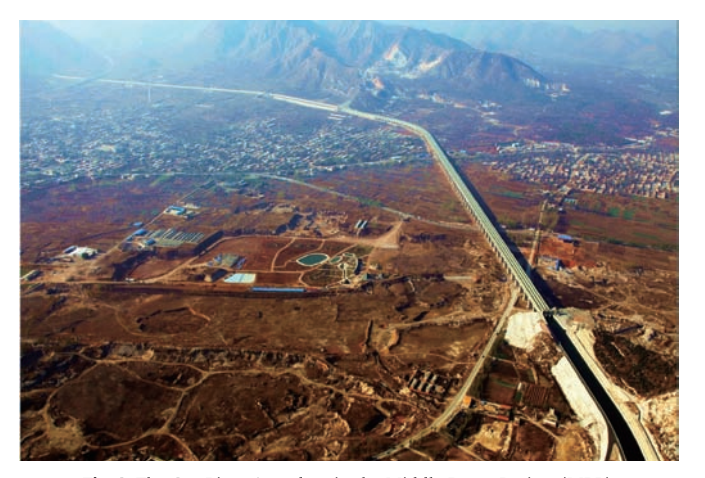
Fig. 3. The Cao River Aqueduct in the Middle Route Project (MRP).