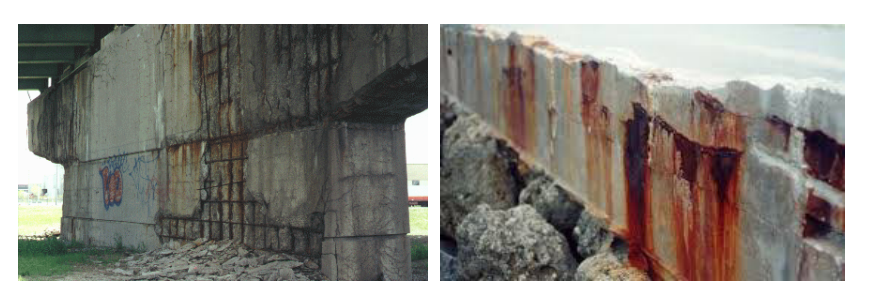
Fig. 8. Reinforcement corrosion of the structure parts in contact with soil.