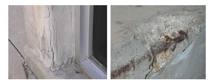
Fig. 5. Concrete carbonation paved the way for frost action.

The carbonation process has influence on decomposition of other properties of cement rock, except calcium hydroxide, and leads to formation of hydrates of oxides of silicon, aluminum and iron. However, the basic consequence of concrete carbonation is the decline of alkaline nature of concrete, which is an important precondition for onset of reinforcement corrosion.