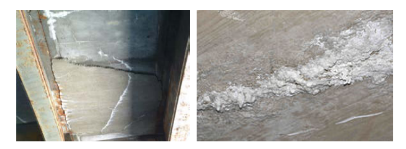
Fig. 6. Leached salts and minerals on concrete surface.

On its way through the cracks in concrete, water may dissolve various minerals present in the hardened cement paste or aggregate. In the beginning, water is not saturated with dissolved minerals, such as, calcium and various kinds of salts, but on further movement of water the mineral concentration in the solution increase until it reaches the critical point, after which the minerals start to leach from the solution and to form deposits in the cracks and on the external surfaces of concrete [4].