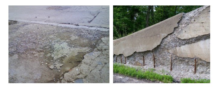
Fig. 4. Concrete degradation caused by crystallization of road defrosting salt.

This kind of concrete degradation, known also as chloride aggression, is particularly prominent in those cases when the structures are positioned near the warm seas, in the conditions of high concentration of chlorides in the sea water, soil and air. Warmer climate, in comparison to the areas with the continental and temperate continental climate enhance salt weathering. In addition, high temperatures have an additional detrimental effect because concretes, for the reasons of better workability are made with a high water/cement ratio which causes, in the concrete hydration process, an increase in the concrete paste porosity, which facilitates capillary rise of chloride-saturated water after concrete hardening. The higher temperatures are the cause of the faster initial hydration of cement which leads to the increased porosity of concrete and facilitates capillary rise and crystallization of chlorine ions [3].