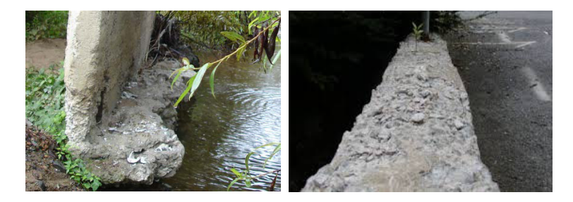
Fig. 1. Concrete degradation caused by frost action.

The most drastic form of the physical impact leading to concrete degradation is frost action. Namely, water which is retained in pores and cracks freezes in low temperatures and exposes concrete to often very high pressures (up to 220 MPa). Detrimental frost action in foundation engineering is most frequently prevented by the proper selection of foundation depth, construction of the gravel layer below the foundations, construction of the proper drainage and construction of adequate moist and water insulation of the parts of the buildings which are in the ground [8, 18].