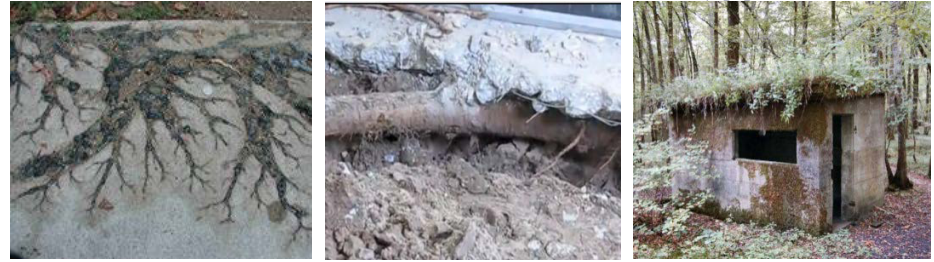
Fig. 2. Degradation of concrete caused by the tree roots and vegetation.

Particularly detrimental in these terms are fig, willow and liquidambar (it is common in warm climates, grown locally as decorative tree whose leaves and fruit resemble those of a chestnut tree) [7]