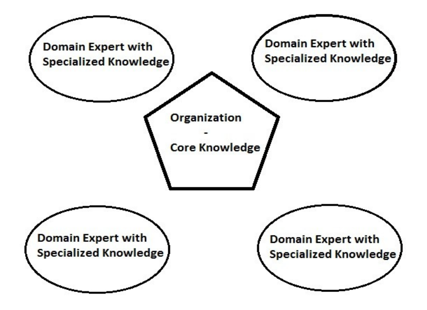
Figure 1. The architecture of core knowledge and specialized knowledge

encouraging organizations to get in touch and collaborate with domain experts from whom to obtain the various types of qualified knowledge needed for a proper management (Esfahani, Kellet, 1988). The success of the knowledge management system, and, subsequently, of the entire management of the organization, will depend on the quality of the knowledge base, hence the quality of the experts from whom knowledge is educed (Doyle, 1988; Montazemi, Chan, 1990). Figure 1 shows the architecture of the core knowledge and the domain experts surrounding it.