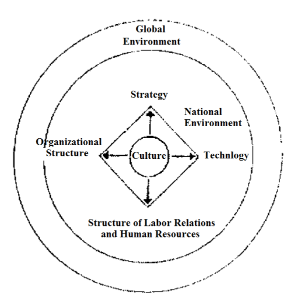
Fig. 1: factors contributing to organizational decision making

decision makers in down-sizing and wright-sizing of the organizations. Fig. 1 illustrates these factors schematically.