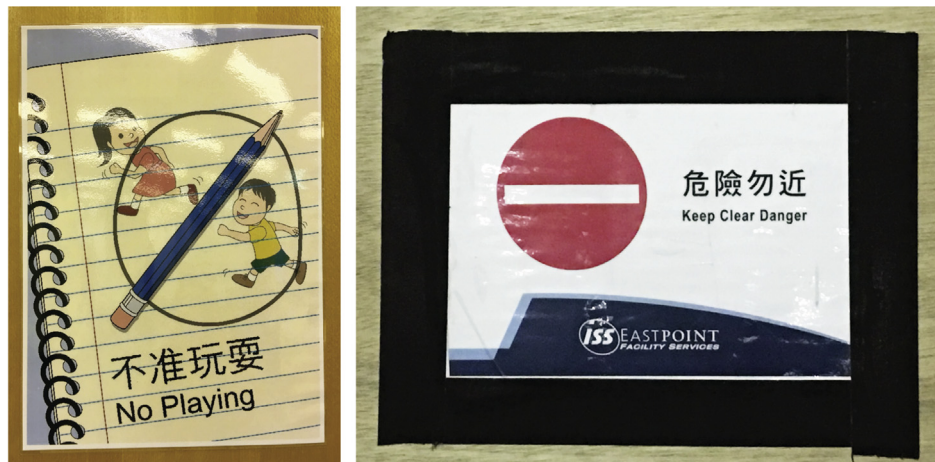
Fig. 1. Colored signs of 'No Playing' in a children's library (left) and 'Keep Clear, Danger' in a children's playground (right).

It should also be noted that the subjects of the above studies were all adults, and it is uncertain whether colored signs and messages have similar effects on children. Children's understanding and choices of color differ from those of adults (Zentner, 2001), particularly in the case of young children who have not received much education and who are not yet restricted by social expectations or requirements (Siu and Kwok, 2004), as they tend not to conform to the prevailing color codes and social stereotypes. Children may have different perceptions concerning the use and choice of colors in safety signs. Kalsher and Wogalther (2007) indicated that warnings designed for children should differ from those for adults and noted that practical research regarding the needs of children is lacking. Currently the literature still lacks information on how children associate colors with safety signs and their contents. Information about how they attribute the color association is still in need. The information obtained from children is worthwhile for designers, engineers, researchers and also policy makers to concern. Children should be included in sign design process to address their needs (Ng et al., 2012). Although designers and human factors experts are the final decision makers who determine the design and colors, it is also essential to provide opportunities for children to express their comments and opinions about color association in safety sign designs.