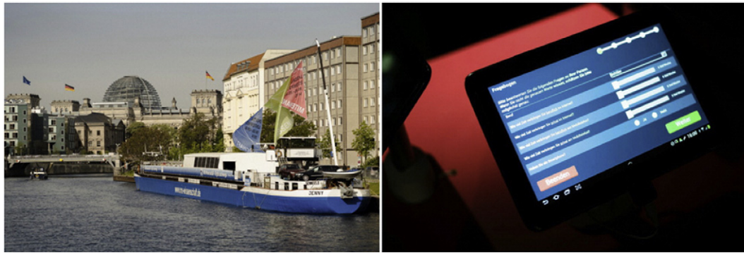
Fig. 1. Left picture shows the public exhibition boat called 'MS-Wissenschaft' ('MS-Science'), where the participants were recruited to the present study; right picture shows a tablet with the questionnaires.