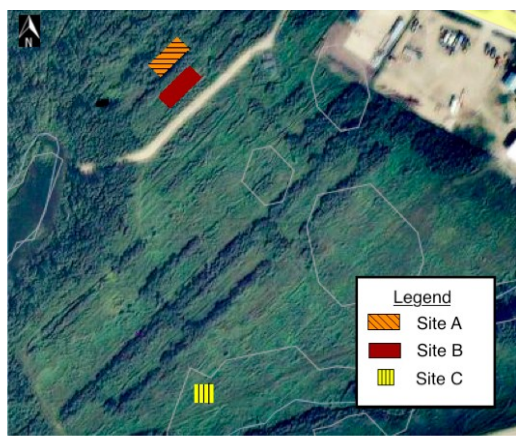
Figure 2. Proposed Agroforestry Community Garden Sites (Sites A and B, between Salix sp. rows) and a "No Tree" Control Site (Site C, in an open field) in Fort Albany First Nation, Ontario.

With no tree-crop interactions and a uniform distribution of plants and topography in Site C, spatial dynamics of soil properties of the "no tree" site are not of interest, making few random samples necessary for inventory. Lacking distinct physical borders, a 20 m<sup>2</sup> area was chosen for this site; it was then divided into 20 one-square-metre quadrants, from which three quadrants were randomly chosen as sample points (Site C, n = 3). From the centre of the site, Site C was located 58 m from any tree or shrub.