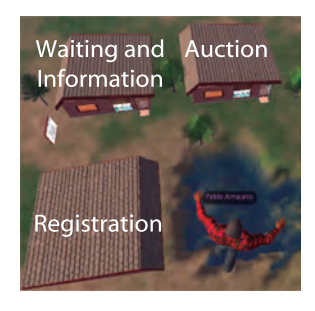
Figure 2: Initial aerial view of v-mWater

market facilitator conducts the auction and the basin authority announces the resulting valid agreements.