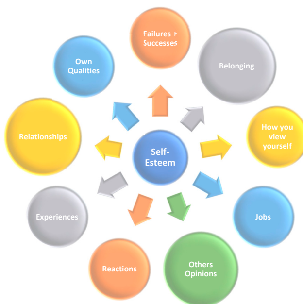
Figure 1. Example of group mind map from session 1.