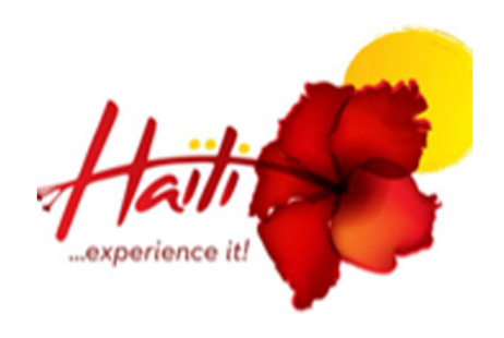
Fig. 1. New logo Haitian DMO.

The study is a prolongation of a study by Muller, Kocher, and Crettaz (2013, p.86), in the sense that their study advocates the change of logo as being positive for a brand as "the introduction of a new logo leads consumers to perceive a brand as modern." However, their study does not consider specific elements constituting logos (e.g. shape and color). Color is an important focus of this study because, alongside corporate name and type-face, design is also one of the main factors that