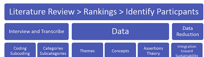
Fig. 2. Qualitative Inquiry.

We organized similarly coded data into categories or "families" that shared some characteristic – the beginning of a pattern. When facilitating cross-case analysis, the coding and recognition of categories compiled across organizations provides synthesis, layers of insight, and new meaning. Synthesis is a multistep, iterative process that combines different things to form a new whole and the primary heuristic for qualitative data analysis. When applying and reapplying codes to qualitative data, it permits the division of data, grouping, reorganizing and linking in order to consolidate meaning and develop explanation (Grbich, 2013). Coding enables moving from the real to the abstract within a model of qualitative inquiry and grounded theory development (Fig. 2). Assertions also progress from the particular to the general by predicting patterns of what may be observed and what may happen in similar present and future contexts (Saldaña, 2015). Within-case analysis confirmed several categories related to integration of sustainability for organizations in the study.