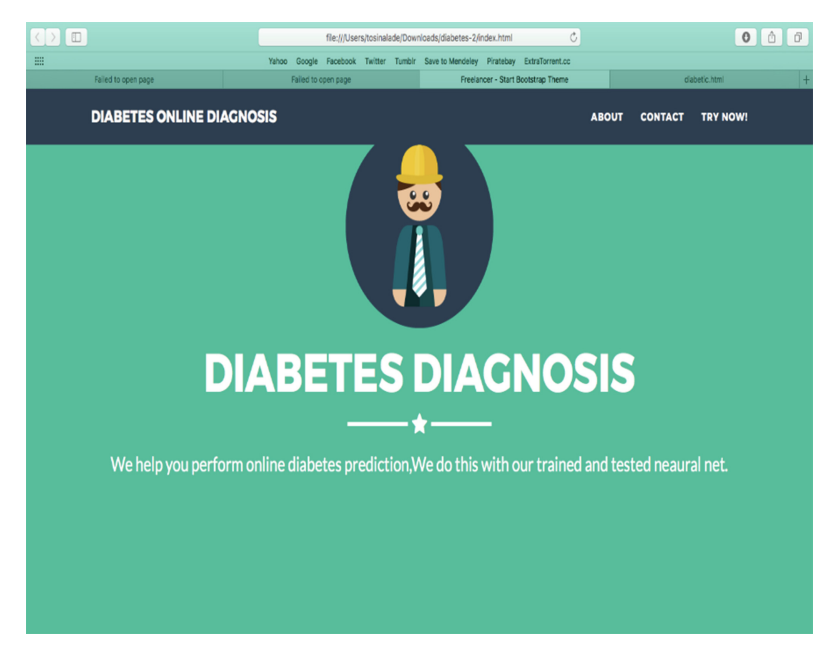
Fig. 3. Homepage of the diagnosis system

Fig. 4. In this page, the user enters required details needed by the input layer for accurate diagnosis.