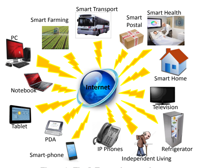
Figure 1: The IoT generic scenario.

are able to connect and communicate over the Internet that can enable a new range of opportunities [3]. Moreover, the physical objects are increasingly equipped with RFID tags or other electronic bar codes that can be scanned by the smart devices, e.g., smart phones or small embedded RFID scanner. The objects have unique identity and their specific information are embedded in the RFID tags. In 2005, the International Telecommunications Union (ITU) proposed that "Internet of Things" will connect the real world objects in both a sensory and intelligent manner [8]. Fig. 2 shows basic IoT system implementing different type of applications or services. The things connect and communicate with other things that implement the same service type. The basic simplified workflow of IoT can be described as follows: