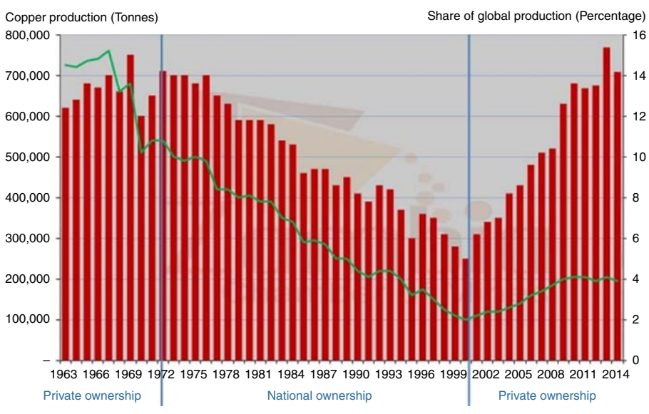
Figure 2. Zambian copper production 1963–2014