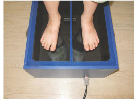
FIGURE 1: Podoscopic survey sample. The authors obtained the participant's parent consent to publish the image.

the point lying most laterally on the head of the V metatarsal bone (metatarsale fibulare: mtf) in cm;