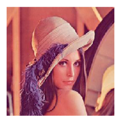
Fig. 2 Original image

MOST_OCCUR (encodes most occurring color)