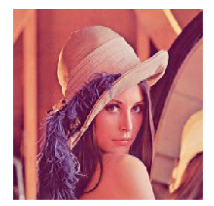
Fig. 6 Decrypted image

Key security plays the major role in protecting information in the presence of adversaries, and allows for secure communication between two or more parties. Here the Key Space is not only large and complex to predict the encryption algorithm takes care of the security purposes through its "INTERLINKED PROTECTION PROTO-COL" scheme. Instead of depending just upon the "KEY" of the encryption, it adds another level of security by adding up the necessity to fetch the encrypted file containing the most occuring color. As a result, it became in-