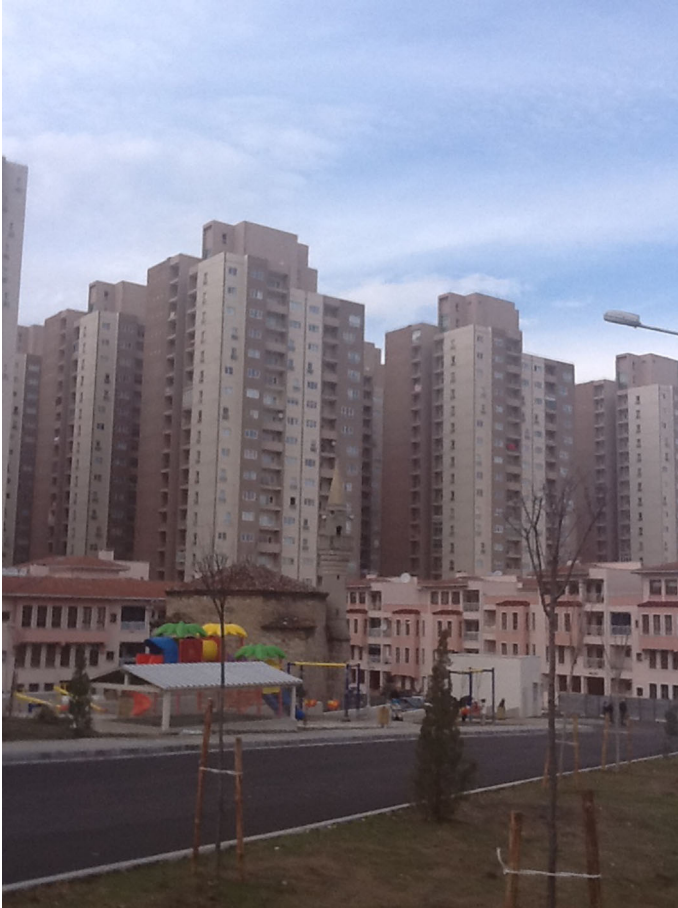
Fig. 5 Current view from the site

another after 2004. These changes aimed at the deregulation of the legal and institutional framework of urban planning and existing bureaucratic control mechanisms over development (Balaban 2012). The outcome was increased autonomy for developers in private sector as well as TOKI itself, which from then on acted as a profit-oriented actor (Özdemir 2011; Batuman 2013). Land-use plans were revised and/or renewed to encourage market-driven redevelopment. Here, urban design was deployed as an instrument to achieve piecemeal projects, to which the plans were later adapted. As we have pointed out above, the stages of the renewal process in Doğanbey reveal the role defined for urban design within TOKI's renewal mechanism. Here, it is reduced to the physical expression (massing) of the economic model and developed without any deliberation with other stakeholders. Contrary to its current practice in Turkey, we argue that urban design can and should serve as a key instrument to develop a holistic approach to the process of urban regeneration, which, rather than prioritizing profit, should be understood as a comprehensive action in the face of urban decline (Roberts and Sykes 2000).