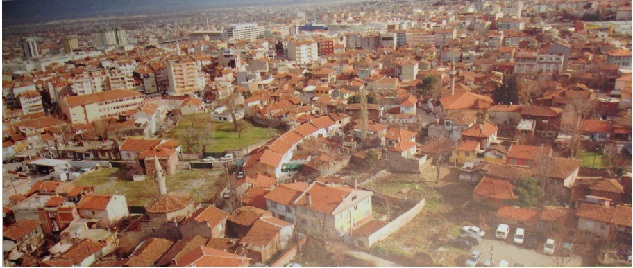
Fig. 2 Doğanbey urban renewal zone before the process