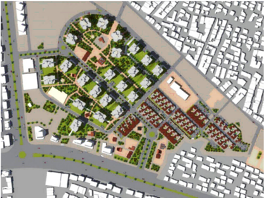
Fig. 4 Site plan of the final version

given to the subcontractors resulted in low-quality materials and poor finishing. These problems only became visible after some of the residents managed to sneak into the construction site and uploaded photographs from the buildings under construction in early 2010 ( tokidoganbey.com 25.01.2010). The residents' vocal protests led to lawsuits and petitions to which TOKI chose not to respond. However, once the structural frame construction was finished, both the misfit of the high-rises in the city's skyline and the lack of open space in the final organization were revealed.