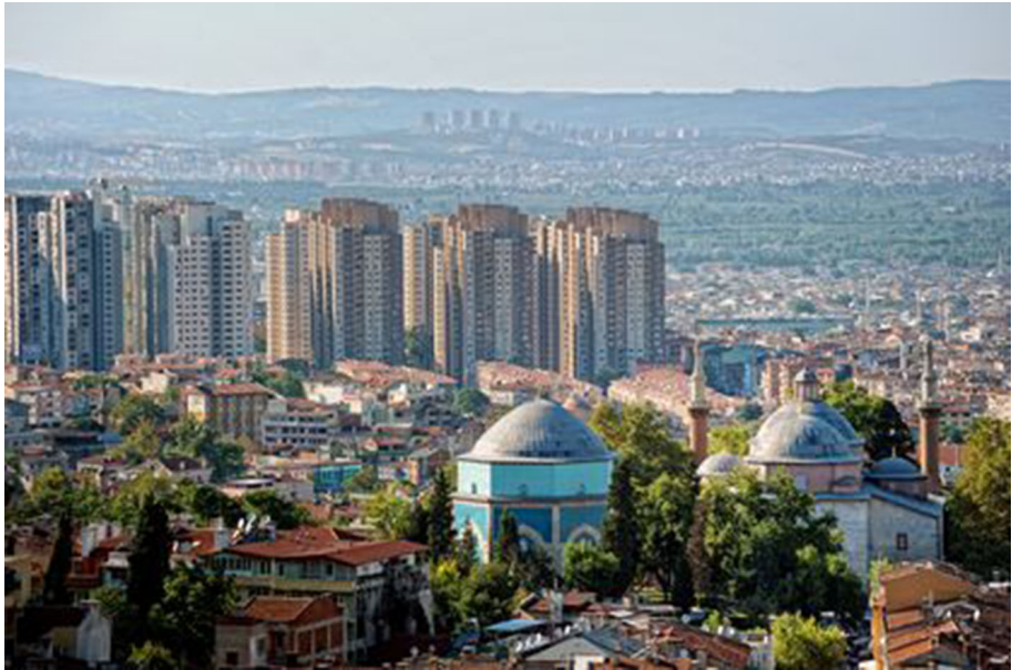
Fig. 1 TOKI Doğanbey high-rises dominating Bursa's skyline

in the following decade. As we will discuss shortly, both this method and this particular form of subjectivity were important in the regeneration of Doğanbey.