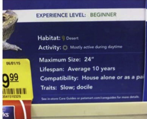
Figure 1. Examples of misleading marketing of accommodation for exotic pets. Image (top left) depicts a highly restrictive, non-naturalistic environment, which implies that a simple "bargain kit" is adequate for turtle housing. Image (top right) depicts a small lizard cage promoted as a "sanctuary," implying a positive environment for occupants. Image (bottom left) depicts an extremely small cage and basic "kit" misleadingly marketed as "premium reptile habitat." Image (bottom right) depicts a lizard being advertised as a "beginner's" pet, implying that it is easy to keep.