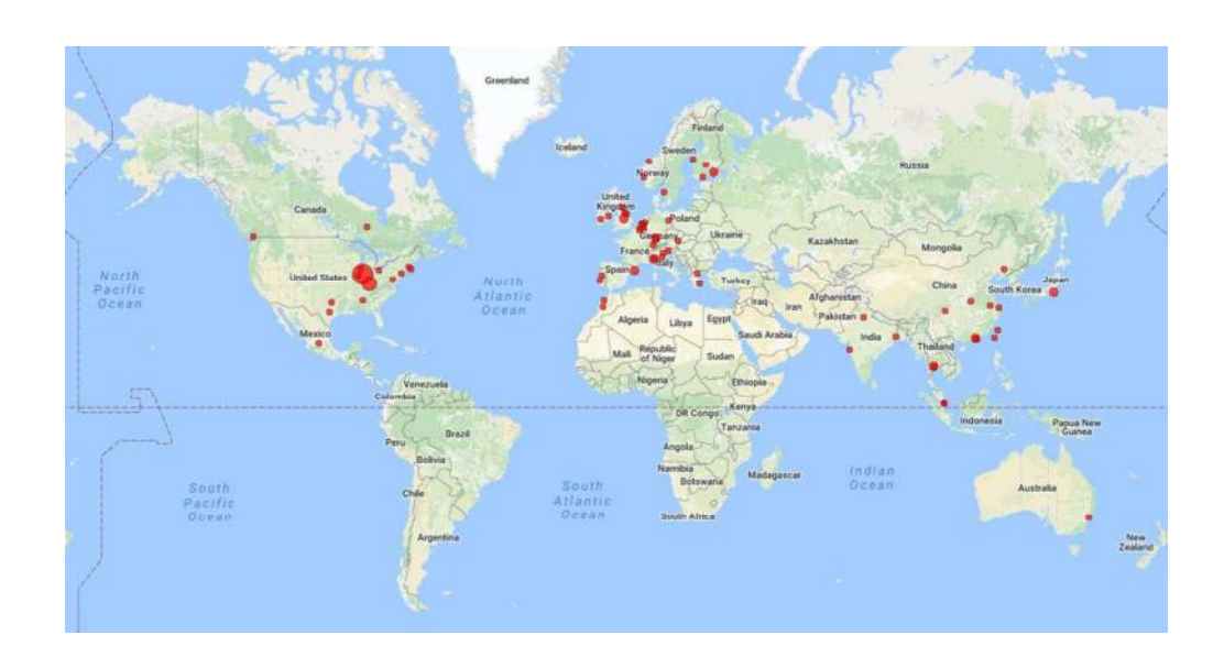
271x144mm (96 x 96 DPI)