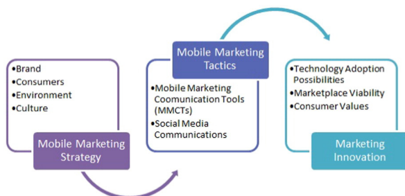
Fig. 1. Conceptual B2C framework based on So-Lo-Mo.

Most of the traditional mail-order retailers have added the internet as a new distribution channel maintaining their physical stores, but using direct marketing as their main distribution channel. On the other hand, manufacturers promote their products online from company sites directly to individual customers such as Dell, Sony, and Nike to name a few. Furthermore, the pure-play E-Tailers which are also known as virtual E-Tailers are firms that sell directly to consumers over the internet, without maintaining a physical sales channel. Amazon and eBay are pure-play retailers (King, 2016). Click-and-mortar retailers are businesses that combine E-Commerce activities with the utilization of physical premises to conduct their business (Bates, 2011; Law, 2016). A small number of successful E-Tailers such as Dell and Expedia.com are now creating physical storefronts to leverage the brand power of the online environment to support more traditional trading activities via stores.